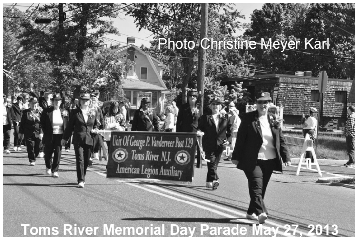
Toms River Memorial Day Parade May 27, 2013