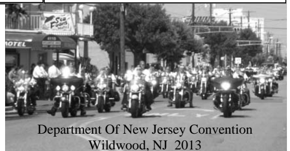
Department Of New Jersey Convention Wildwood, NJ 2013