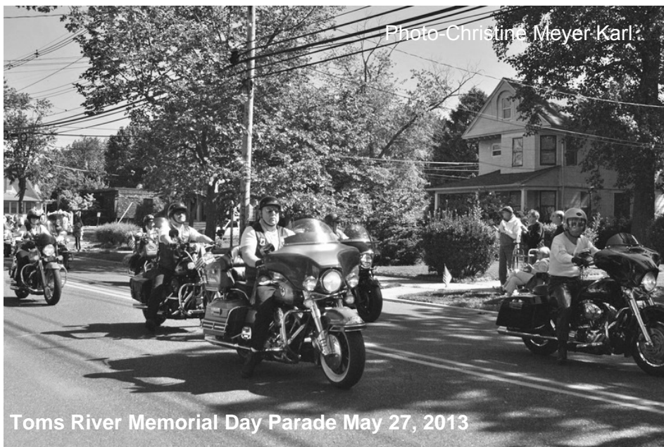
Toms River Memorial Day Parade May 27, 2013

all that helped and those that came out to support a great and worthy event. Our fund raiser this year will go to Vet Work of Lacey Twp. an organization that helps Veteran's down in their luck and in need. Obviously a worthy recipient.