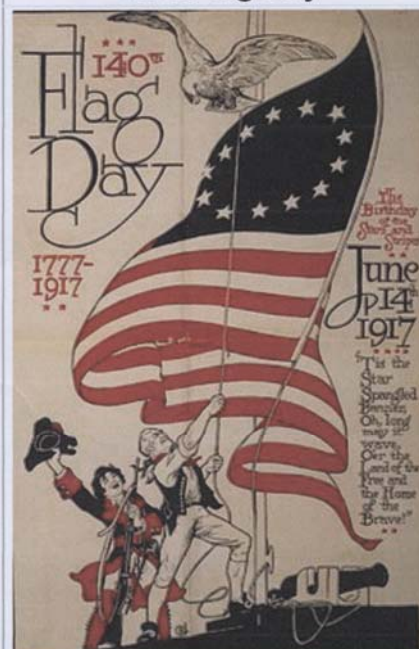
Poster commemorating the 140th Flag Day on June 14, 1917