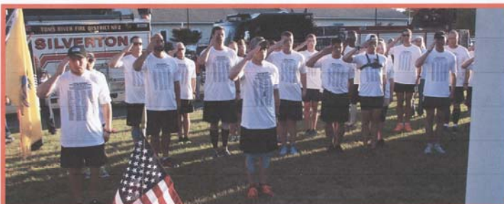
Runners at American Legion Post 129 - 2016

Join Gold Star Families and the Riders of Post 129 for a