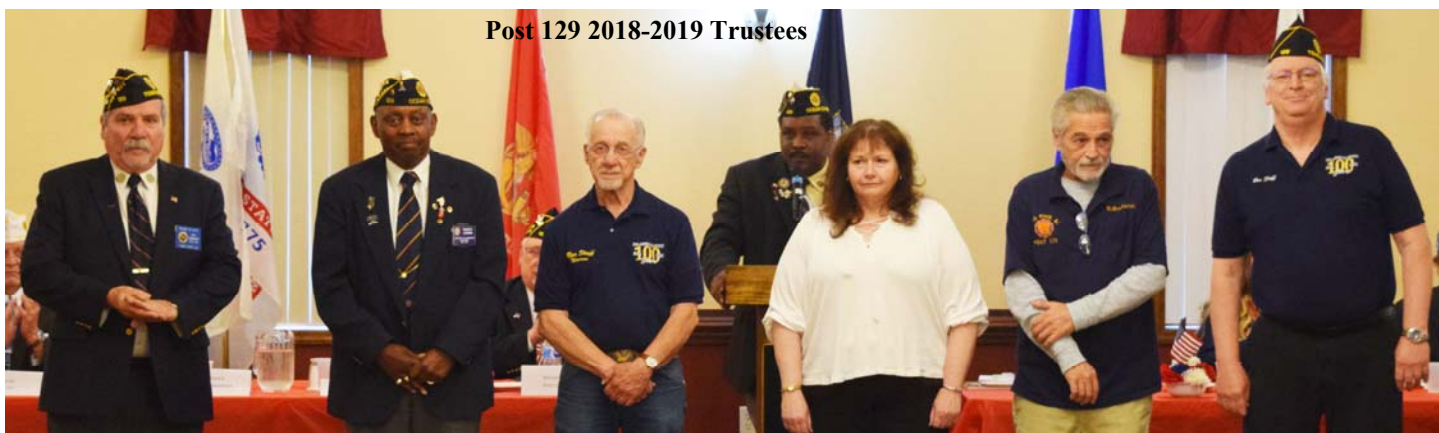
Post 129 2018-2019 Trustees